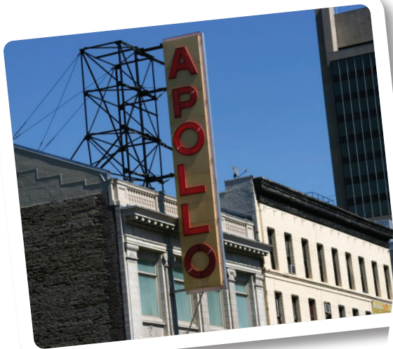
Apollo Theater, Harlem, NY

My favorite thing about performing jazz is the freedom involved in it. When jazz musicians improvise, or make up melodies on the spot, we enjoy a great deal of freedom and self expression. Jazz musicians have been performing in Harlem for a long time, in places like the Apollo Theater and Lenox Lounge.